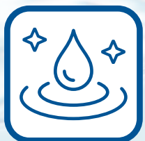
ULTRA PURE WATER