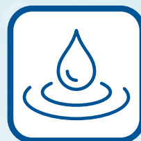
SURFACE & BATHING WATER